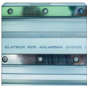
Taiwan Hiwin Mute Guider Rail