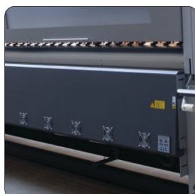
Infrared air-drying System