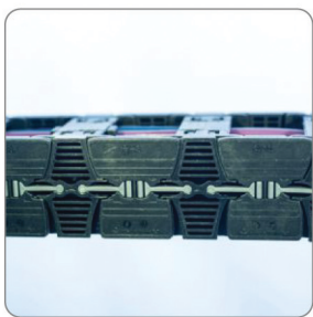
IGUS Tank Chain