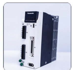
Japan Panasonic Motor (Servo Driver)