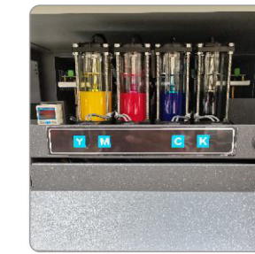
Electric glass cartridge