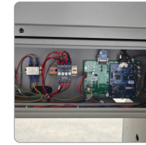
High Performance Control System