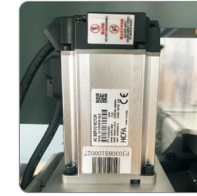
HCFA Servo Motor