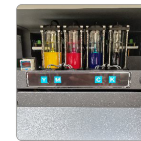
Electric glass cartridge