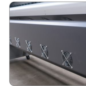
Infrared air-drying System