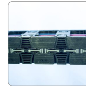
IGUS Tank Chain