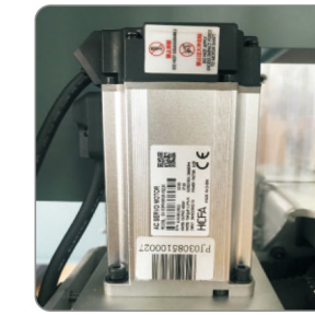
HCFA Servo Motor