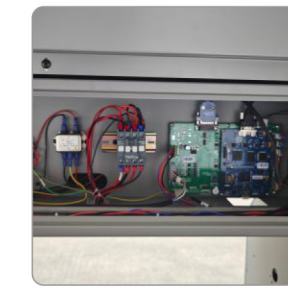
High Performance Control System