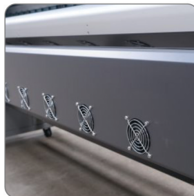
Infrared air-drying System