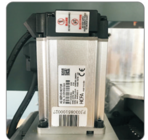
HCFA Servo Motor