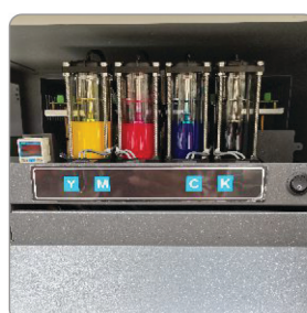
Electric glass cartridge