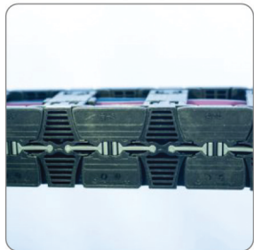
IGUS Tank Chain