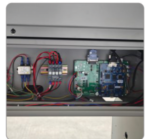
High Performance Control System