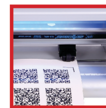
Camera for auto contour cutting