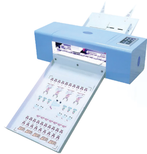
A3 MAX (Fiber Body)