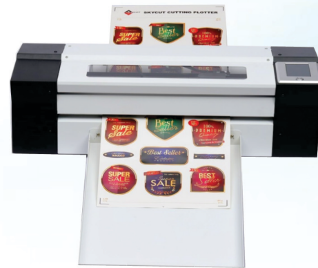
A3 MAX 2 (Metal Body)