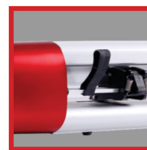
Fully Adjustable Pinch Feed Assembly