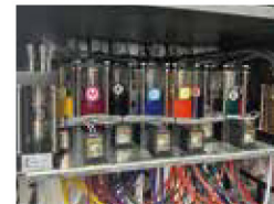
Ink negative pressure system, better ink fluency, ensuring stable output for high-speed production