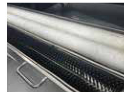
Equipped with a belt-guided sponge brush, it can be cleaned while printing to ensure that the fabric is clean and tidy during the printing process