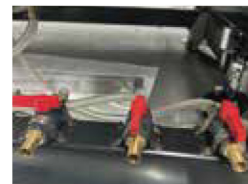
The guide belt is equipped with water-based function to ensure that the fabric is clean and also can adapt to more ink application solutions