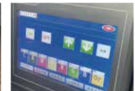
LCD monitoring screen, to detect the stability of the ink system and stepping system at any time, easy to operate and adjust