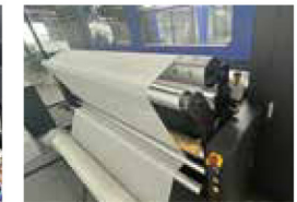
The special feeding system for fabrics can adapt to cotton fabrics of different thicknesses