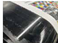
High-density, high-precision fabric media belt systems & gluing platform, better fit the fabric, accurate fabric stepping

The operation is simple, the cloth surface flattening effect is good, modular design, the maintenance of each component is convenient and brief, the ink replacement is quick and convenient, the degree of automation is high, the print head is cleaned by one key and moisturized by one key.